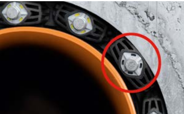
PGKD 400 with one segment not tightened – installation error immediately detected