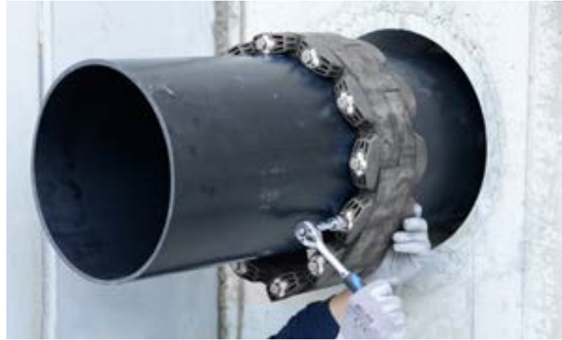
PGKD 400 – tightening of segments