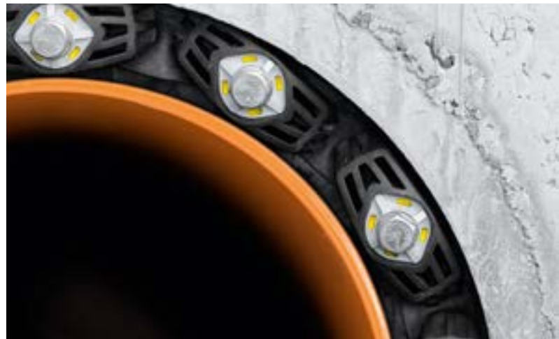
PGKD 400 – fully installed, all viewing window indicators are filled with yellow