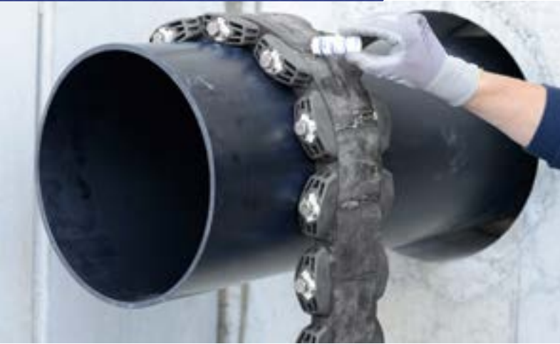
PGKD 400 – installation preparation with lubricant PGM