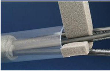
Separate cable(s) with foam