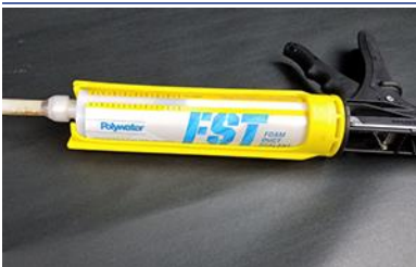
TOOL-250 with FST-250

Holding cartridge upright, remove nut and plug. (Plug can be saved for re-use of cartridge.) Attach static mixer and tighten into place.