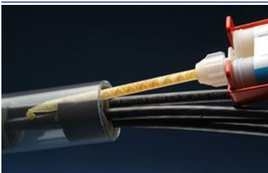
Dispense foam sealant