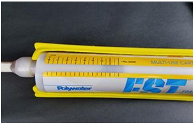
Mark on side of cartridge