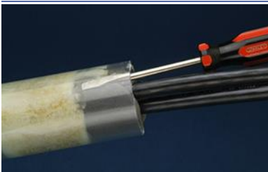
Use screwdriver to check for voids

Static mixer is reusable 7-10 minutes after injection.