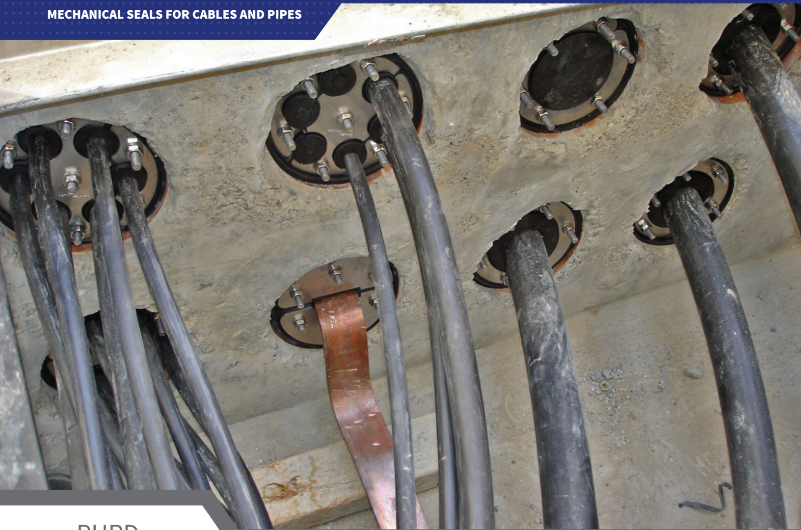
Pictured: Various PHRD combination seal solutions