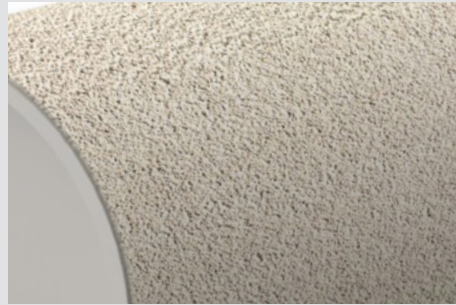
Close up of special cement-bound coating