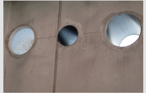
Suitable for all wall thicknesses