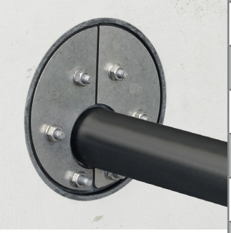
PHRD have plugs in each opening, offering the flexibility to use one or all of the custom cable/pipe openings.