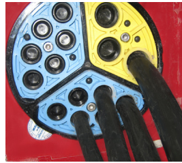
Different segments can be connected.