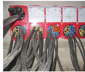
Wall inserts fitted with SEGMENTOS.